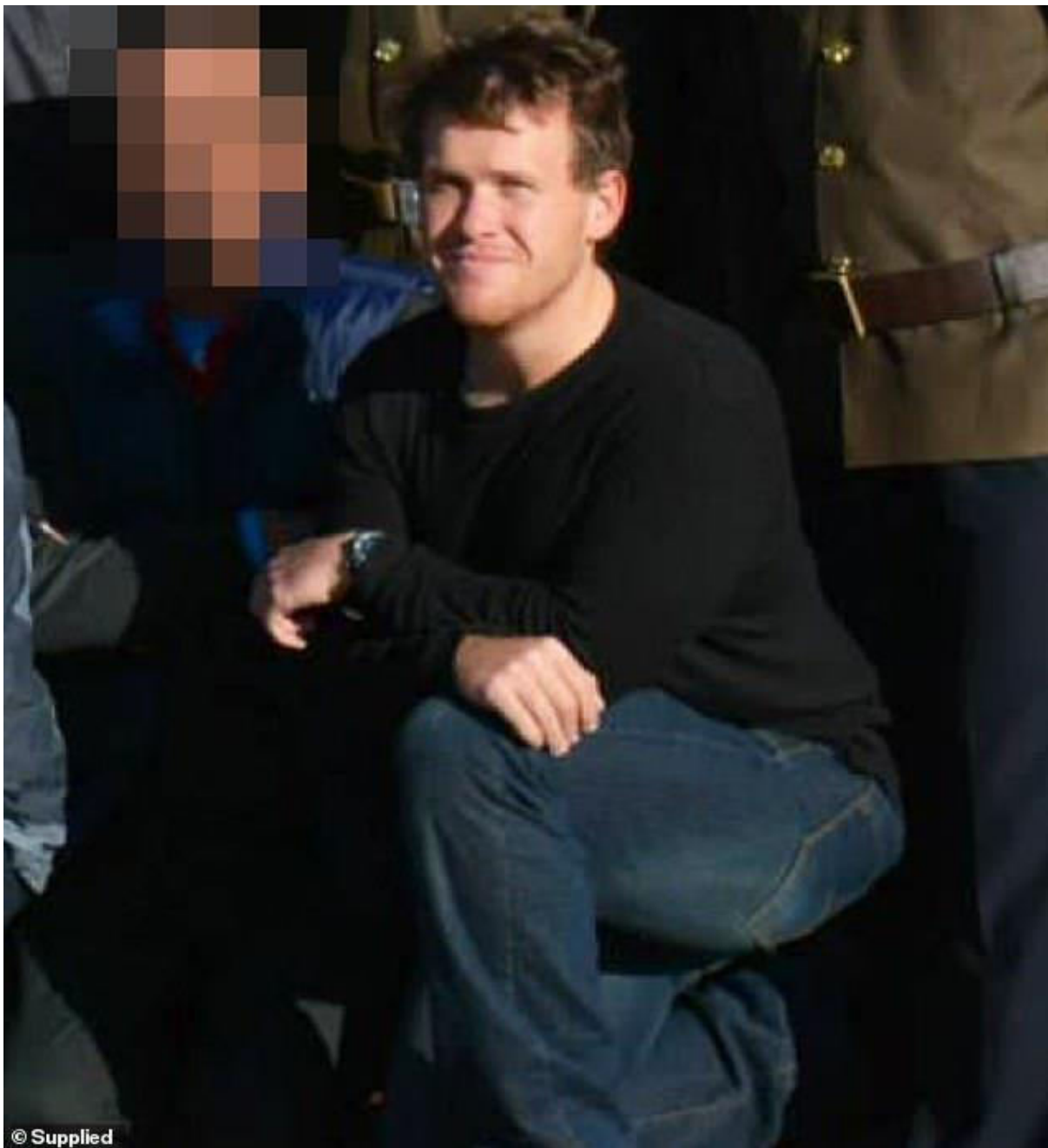
Australian-born Brenton Harrison Tarrant (pictured) allegedly opened fire at the Al Noor and

'I was trying to grieve and it came to me then that I wish I could give him a hug. Some people might call me crazy but I speak from my heart, I am not pretending - if I got an opportunity I would hug him,' he said.